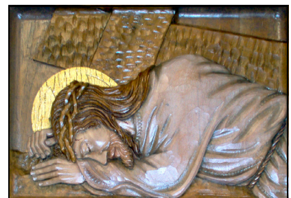
Station #9: Jesus Falls a Third Time