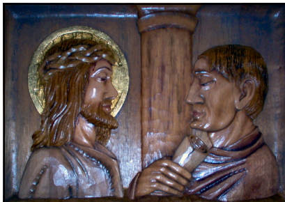
Station #1: Jesus is Condemned to Death

Stations of the Cross are quite appropriate to the Lenten season, as we prepare ourselves spiritually for the conversion possible due to Christ's Passion and Resurrection. Following one of our booklets, those participating pass from station to station with prayers and meditation at each. The scenes of the fourteen traditional stations, depicted on our stations, consist of the following: