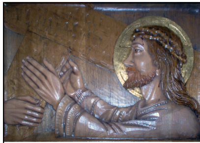
Station #2: Jesus Takes Up His Cross