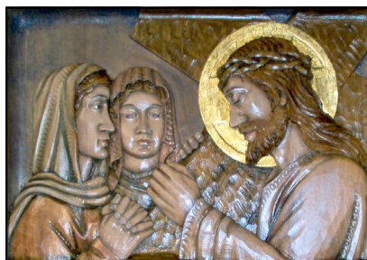
Station #8: Jesus Meets the Women of Jerusalem