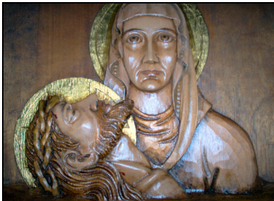
Station #13: The Body of Jesus Is Placed in the Arms of His Mother