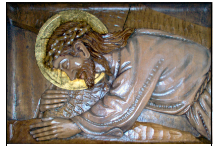
Station #3: Jesus Falls the First Time