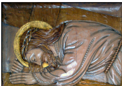
Station #7: Jesus Falls a Second Time