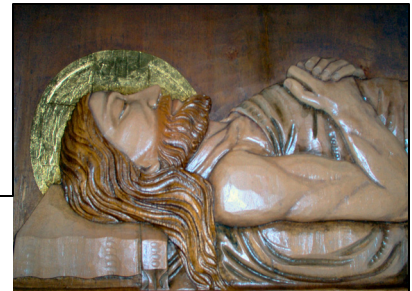
Station #14: Jesus is Laid in the Tomb

The addition of a "15 th Station" to commemorate the Lord's Resurrection is celebrated at the Crucifix. It is important for us to remember the Passion in the light of the Resurrection, with the hope and confidence given us by our Christian faith.