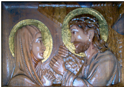
Station #4: Jesus Meets His Afflicted Mother