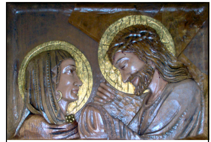
Station #6: Veronica Wipes the Face of Jesus