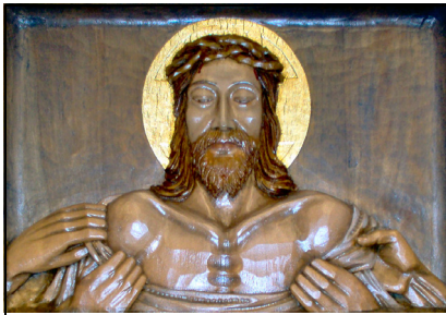
Station #10: Jesus Is Stripped of His Garments