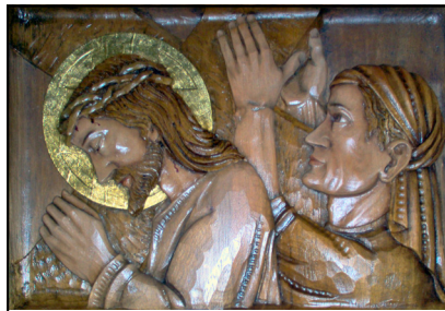
Station #5: Simon of Cyrene is Forced to Take Up the Cross