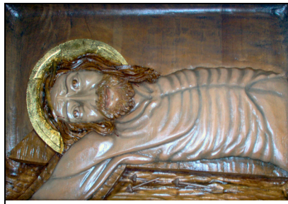
Station #11: Jesus is Nailed to the Cross